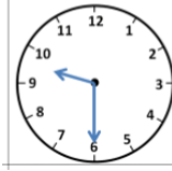
Half past 9