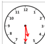
Half past 5