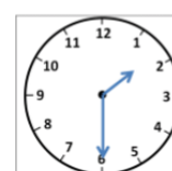
Half past 1

This is half way around the clock. The hour hand is in between one hour and the next.